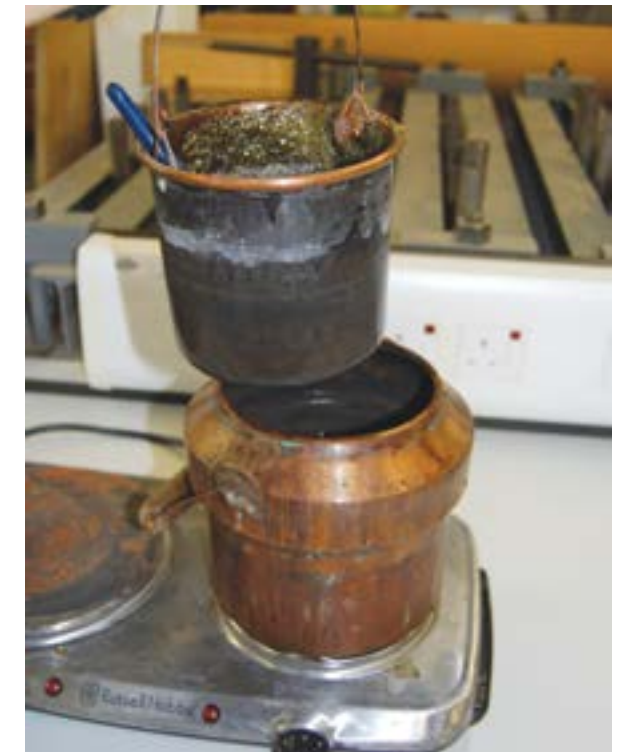
An old glue pot will make a perfect bain-marie

I generally use shellac wax for the hard element obtained from Laverdure in Paris or Kremer Pigments in Germany. I know that many of my colleagues are happily using carnauba that has a similar hardness. In my experience the bright yellow coloured carnauba will form light coloured residues in the grain of the wood that can be an issue for dark timbers like ebony. This problem doesn't occur with shellac wax. It's also possible to dye your wax with a chosen pigment or dye but beware of the risk of the pigment migrating and staining the wood.