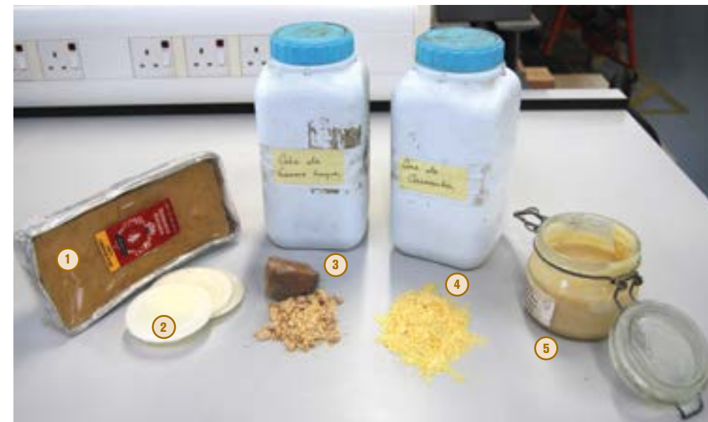
A block of brown beeswax (1); biscuits of high quality white beeswax (2); shellac wax (3); carnauba wax (4); the mix is stored in an airtight container (5)

200g beeswax 100g shellac wax 200g white spirit 100g turpentine