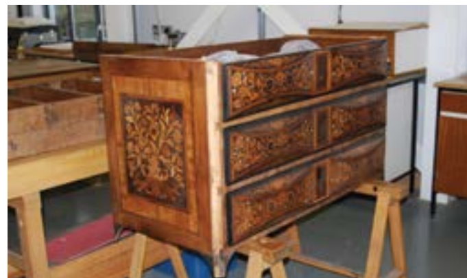
Wax is a perfect one-stop finish for this 17 th -century marquetry commode

One should remember that French polishing – the application of shellac with a rubber to impart a high shine – is almost certainly an invention of the second quarter of the 19 th -century and not appropriate for antiques that predate 1820.