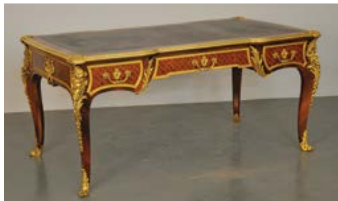
This desk from around 1900 has received a wax finish directly on to a shellac polish

In the field of restoration and conservation a wax finish is becoming increasingly popular as, not only is it easily reversible, but it's also closer to the original 18 th -century practice.