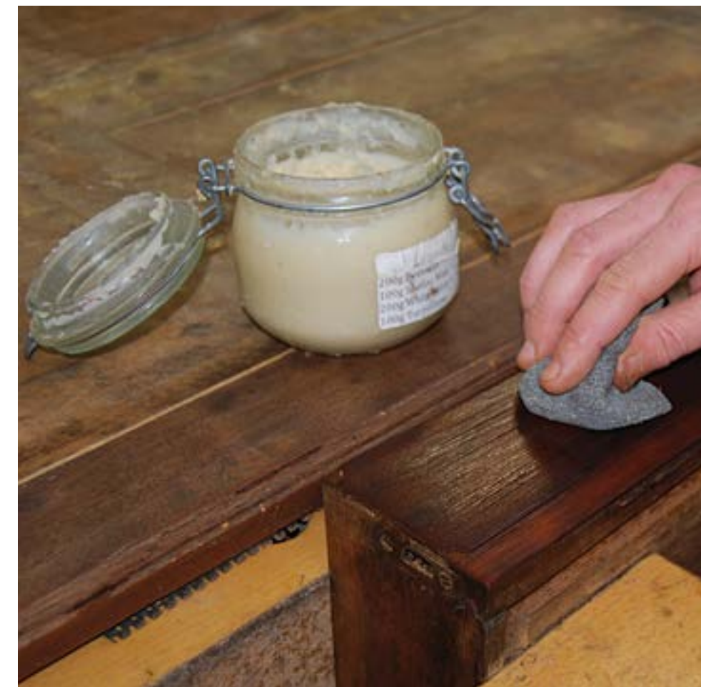
A soft cloth dampened with white spirit makes applying hard wax a little easier

The application of wax will be eased by the softness of the wax however, in all cases, the secret of a good wax finish lies in not applying too much. Wax should be applied with a rag and, if necessary, the application marks can be smoothed by wetting the rag slightly with white spirit. When using a very hard wax the applied wax can be smoothed using a rubber in the traditional French polishing style i.e. a woollen pad covered with a rag then impregnated with white spirit. Unlike varnish, layering the wax is not going to produce anything different and one coat is sufficient. Once fully dried the surface of the wax can be burnished with another clean, soft rag. However, for that extra professional look try burnishing with the sheepskin pad on the Festool Rotex tool.